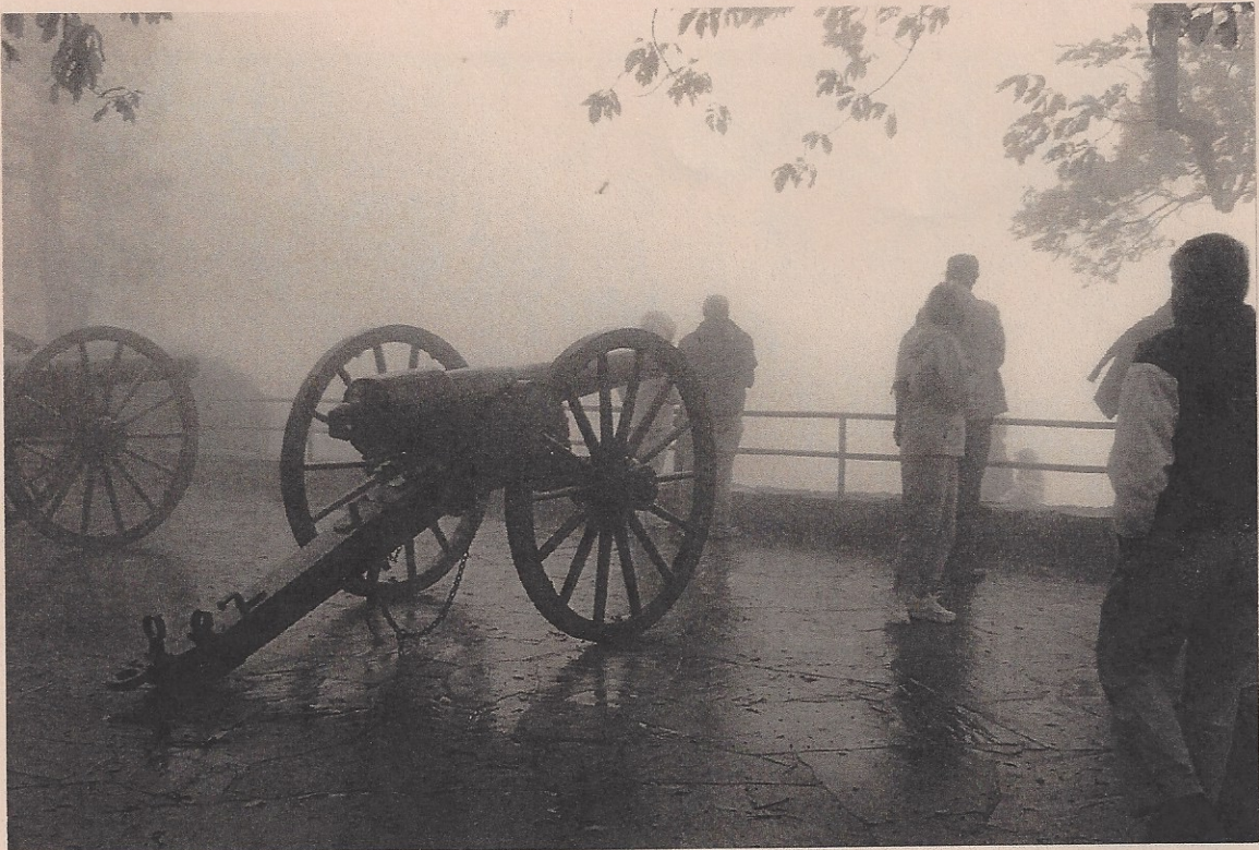
Our (non)view from Lookout Mountain because of dense fog was much the same the soldiers had in Nov. 23, 1863, the "Battle Above the Clouds."