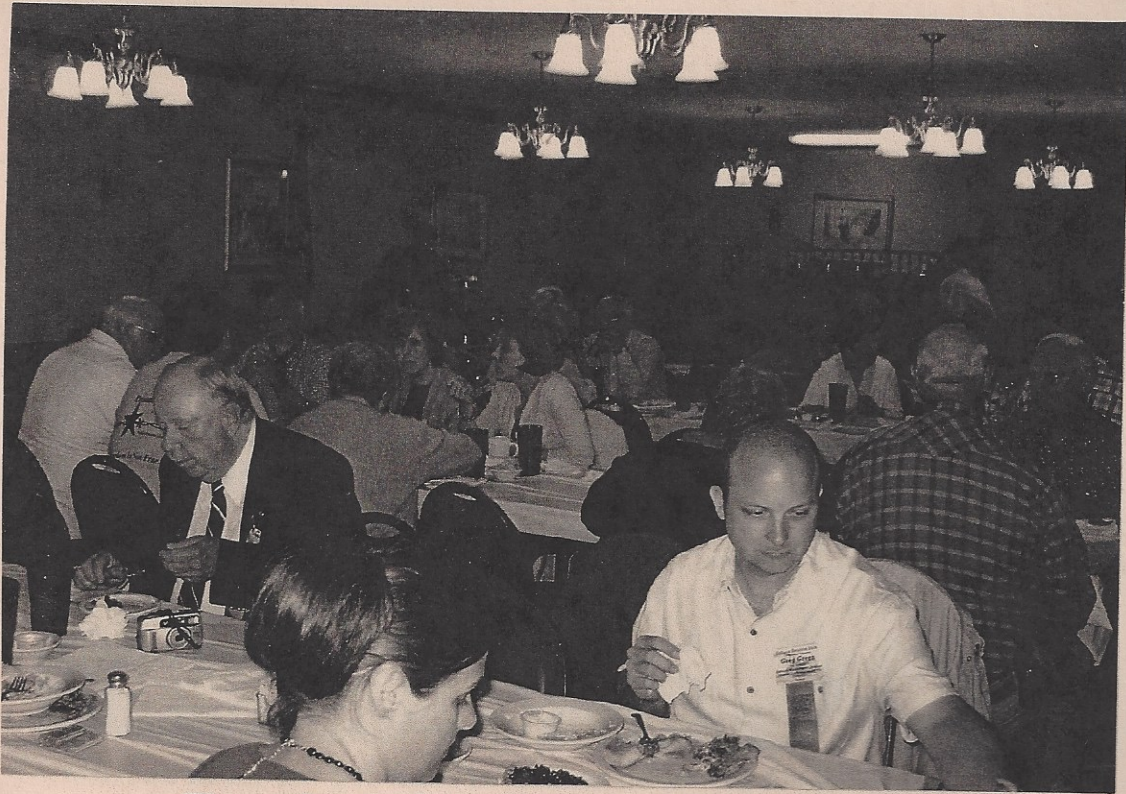
The southern-style meal at our banquet was delicious!